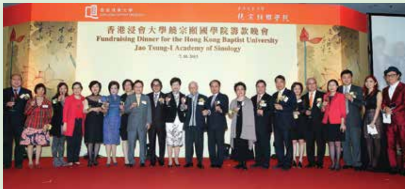
The event was well attended by more than 400 distinguished guests 逾四百位嘉賓出席，場面熱鬧

大學於2013年10月7日舉行「香港浸會大學饒宗頤國學院籌款晚會」，為國學院合共籌得逾港幣4,600萬元，當中饒公書畫精品慈善拍賣籌得港幣2,800多萬元。晚會獲多位捐款人慷慨捐資，包括羅嘉穗小姐，MH、林長泉伉儷、蘇啟聲伉儷、孫少文博士，JP伉儷、深圳市唐商投資集團有限公司、智韜慈善基金有限公司等。