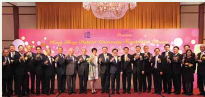
Toasting by the officiating guests 各主禮嘉賓向在座嘉賓祝酒

香港浸會大學基金於2013年11月5日假香港賽馬會跑馬地會所舉行晚宴，款待香港浸會大學基金董事局成員、永遠榮譽董事、永遠榮譽主席、榮譽主席及大學支持者，以感謝他們多年來對大學的鼎力支持。